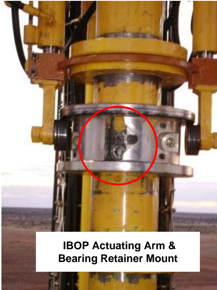
IBOP Actuating Arm & Bearing Retainer Mount