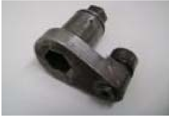
IBOP Actuating arm (dropped object)