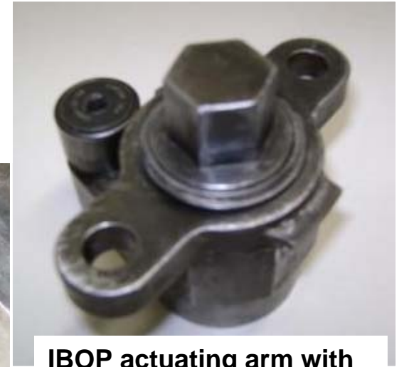
IBOP actuating arm with retainer