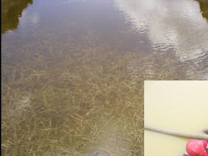
Water is sucked from 'Turkey's Nest'